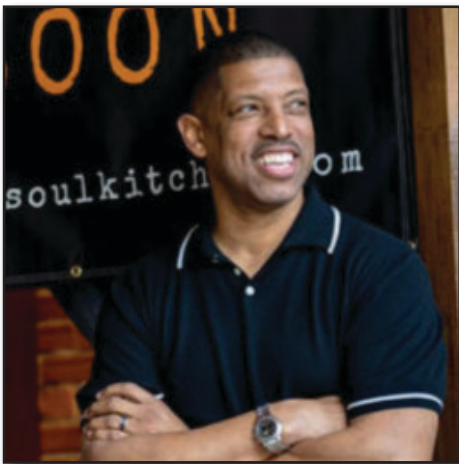
Kevin Johnson Former NBA All-Star, Mayor of Sacramento, and Owner of Oak Park Brewing Company